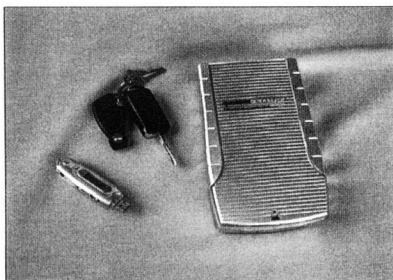
Figure 3. The USB-connected, solid-state memory device (on the left) and external hard drive (on the right) are examples of containers used to transport stem cells between the office computers and the home backup computer. The type of container is not important. The important point is that the transfer is done on a daily basis and tested at least weekly.