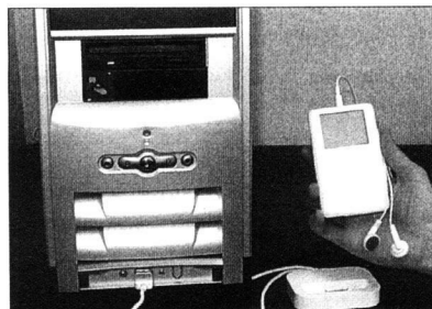
Figure 4. Stem cells to go! Devices such as the Apple iPod contain a small hard drive with enough capacity to store all of my office stem cells ... with room left over for music and audio books to listen to on the way home! Cost-effective multitasking...that's what paperless dentistry is all about.