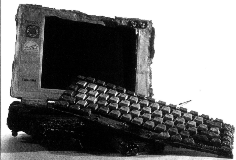
Figure 1. Bad things happen! Even if your patient records never end up “extra crispy,” you have a responsibility to be prepared. The good news is that the data on this very badly damaged computer was saved and restored by Drivesavers (drivesavers.com), a data recovery service. An additional discussion of disaster recovery is available at PaperlessDentistry.com.

Hurricanes are thankfully infrequent in California (where this author lives), but fires, theft, and computer failures are fairly common. 2 It is the role of a good computer backup to protect us from any and all of these catastrophes. But what constitutes a “good” backup? It needs the following: (1) to be stored outside of the office, (2) to have multiple copies, (3) to be done on at least a daily basis, (4) to be tested, and (5) to have the ability to restore the entire office computer system in the event of a total catastrophic event. (And the easier and less expensively it can accomplish this, the better.) Unfortunately, “traditional” data backups do not fulfill these criteria and leave dentists exposed to some extreme risks.